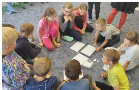
Cogito Feuerstein School in Czech Republic 175 Students, 30 Teachers https://cogito-centrum.cz/